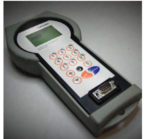
Hand-held ultrasonic clamp-on flowmeter KATflow 200 with one flow channel.

The KATflow 150 is capable of measuring flow as well as temperature related energy consumption . Its comprehensive output options also enable the instrument to monitor and regulate flow processes . By employing the optional speed-of-sound measurement function, the flowmeter can be applied for concentration monitoring tasks or as part of a non-invasive product recognition system.