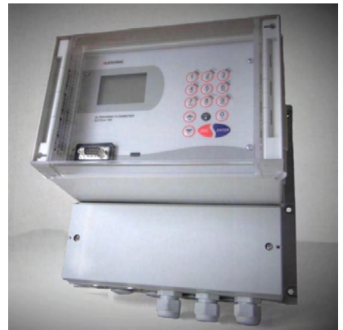
Adjustable, fixed installed ultrasonic clamp-on flowmeter KATflow 150 with up to two flow channels and various optional process in- and outputs.