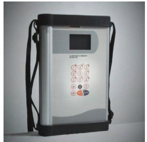
Portable ultrasonic clamp-on flowmeter KATflow 230 with two flow channels.