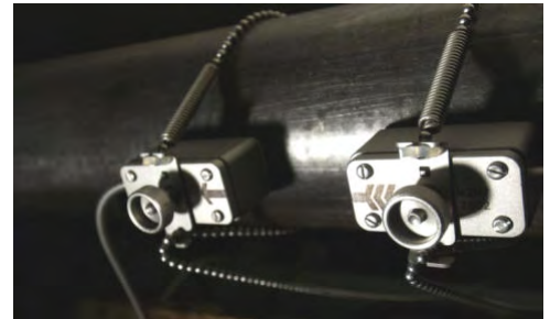
Ultrasonic sensors strapped onto pipe surface.

Katronic's clamp-on flowmeters apply non-invasive and contactless ultrasonic measurement techniques. As the sensors are clamped onto the pipe wall, the instruments can be installed without the need to open pipelines and are virtually maintenance free .