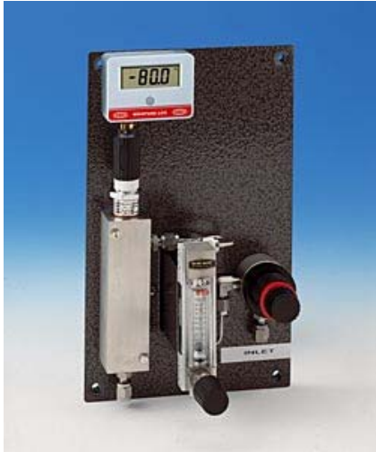
Sensor & meter inserted for illustration purposes.

The SU4 will reduce the pressure from the dryer to give a flow suitable for measurement. It combines a pressure reduction control, sensor holder and a flow meter for up to 10 liters per minute. (1-2 liter is usual for continuous use). Moisture measurement under pressure will not give the correct answer but room pressure used in the SU4 will read correctly.