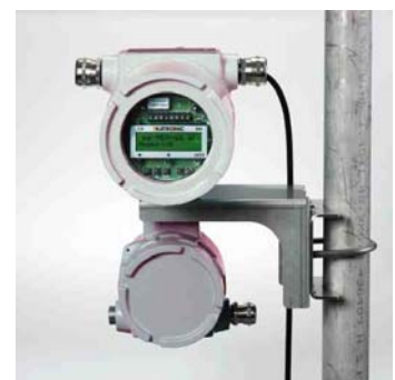
Ultrasonic Flowmeter for Hazardous Areas (ATEX)