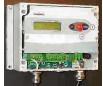
Single Channel Ultrasonic Flowmeter

All ultrasonic flowmeters feature extremely high measuring rates, DSP signal processing and comprehensive statistical evaluation of the raw data. Even under difficult measuring conditions, accurate and reliable measurements can be guaranteed. Now it is possible for the user to monitor processes where previously technical or economical factors prevented the use of non-invasive measurement techniques.