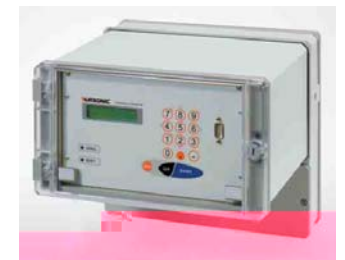
Multi Channel Ultrasonic Flowmeter